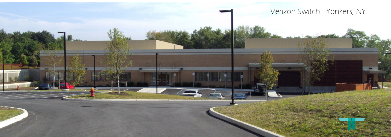
Verizon Switch - Yonkers, NY

Verizon Wireless - Pennsylvania and New Jersey MSC Switch Design Expansions including Architectural/ADA/Life Safety, Structural/Seismic, Mechanical Systems, Electrical Systems, Plumbing Systems, Security, Fire Detection/Fire Suppression, Building Automation Systems, Basis of Design, Project Specifications, Equipment Cuts/Systems Review, and Engineering Cost Estimates/Project Schedule